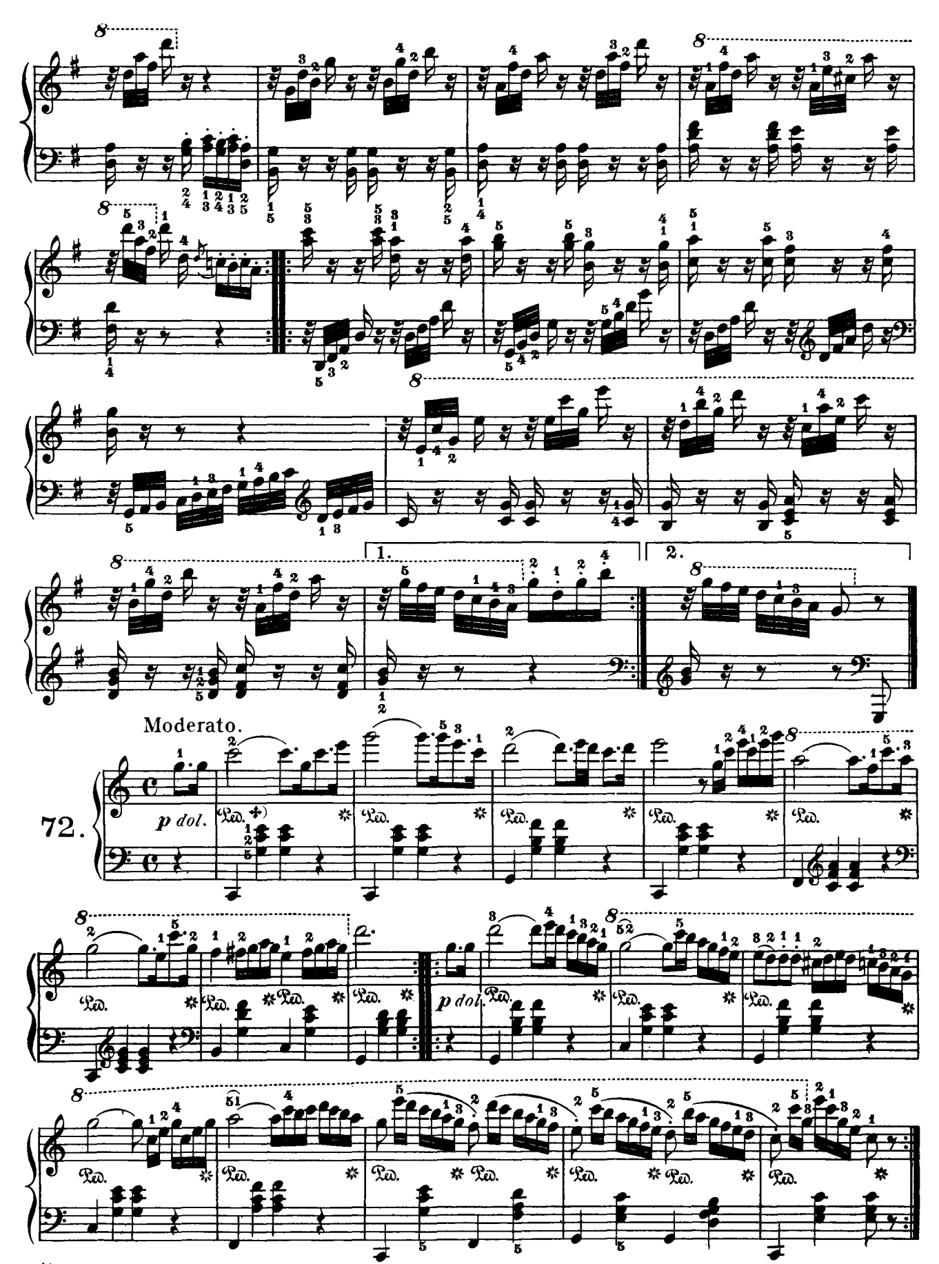
+)究 (Pedal) means that the foot should press down the damper Pedal, until directed by the proper sign (*) to release it.