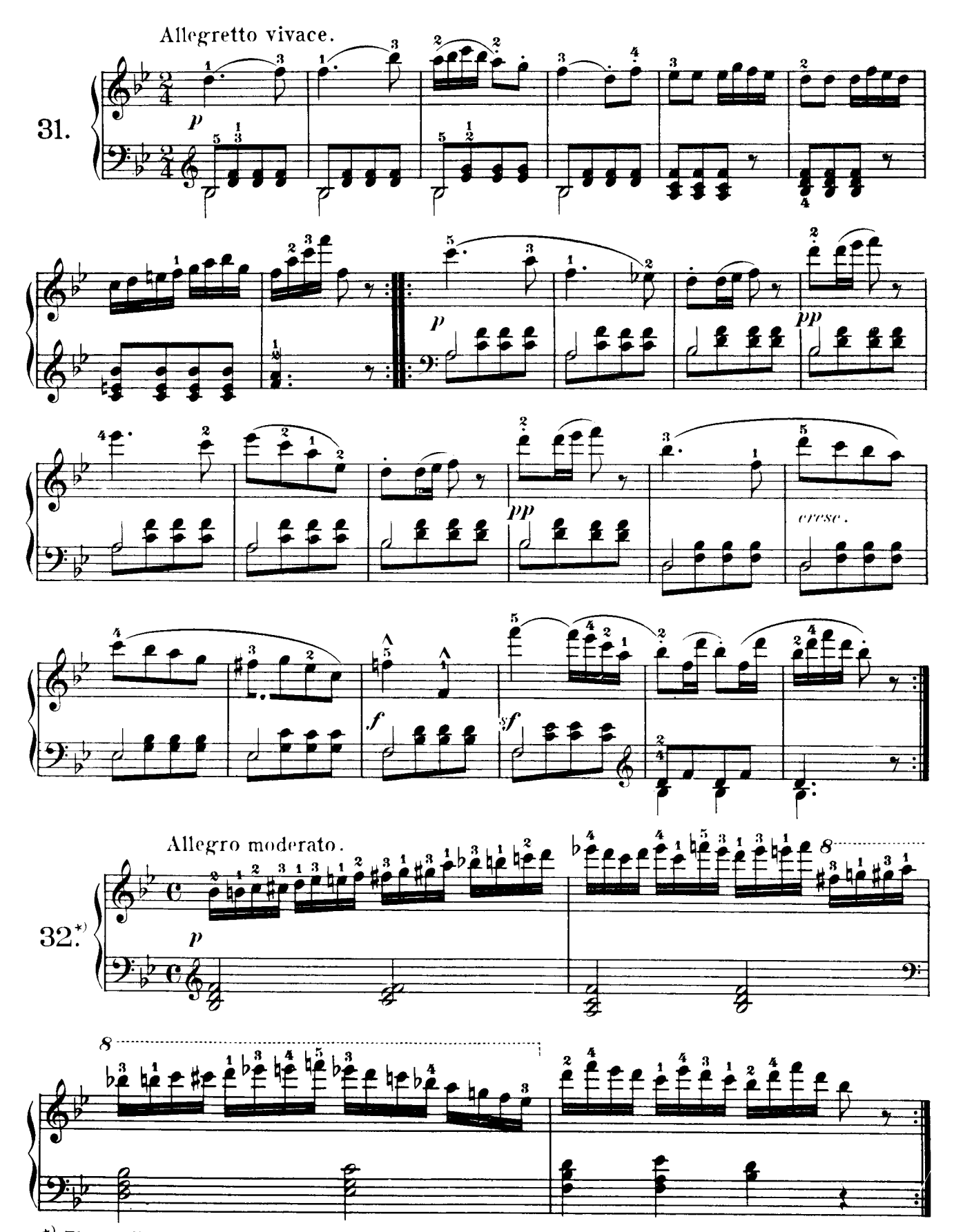
*) The pupil should be able to play the scales fluently in all the keys, if he is to derive full benefit from the following more difficult pieces.